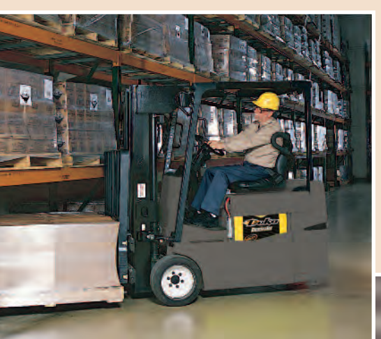
*The Dominator and Gel-Mate, in opportunity charging operation, will require a period of uninterrupted recharge to return the battery to full charge.

For over 60 years, the DEKA name has stood for the highest quality in lead-acid batteries, accessory products, service and support.